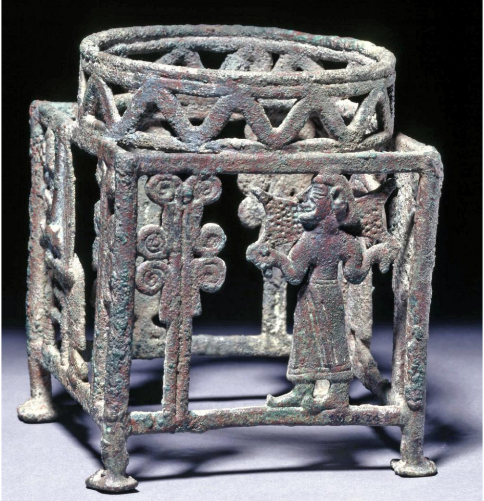
Fig. 2 - Bronze four-sided stand with figural decoration on each panel, especially in foreground a male figure facing a tree bearing an oxhide ingot over shoulder (British Museum 1920,1220.1; 1250 - 1050 BC) from Cyprus, possibly Kourion.